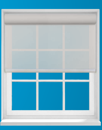
ne Serena Shades*